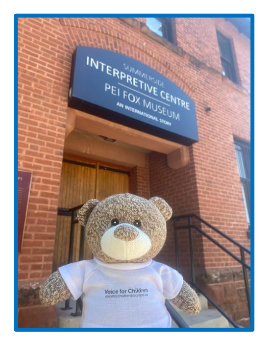
Fox Museum Hmmm...and why not a bear museum?