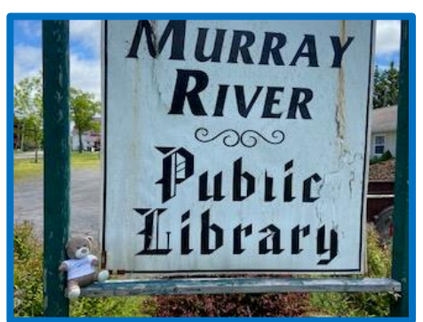
Provincial (Public) Library