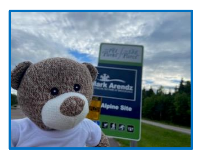
No snow, no go!