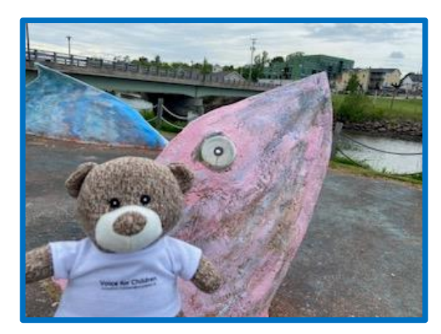
Fish Statue - One fish, two fish, yellow fish, pink fish ... or something like that