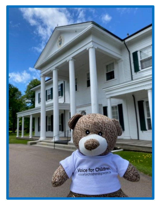
Government House I kind of expected to be invited in for some tea.