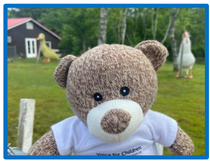
So we returned a second time....things went better.